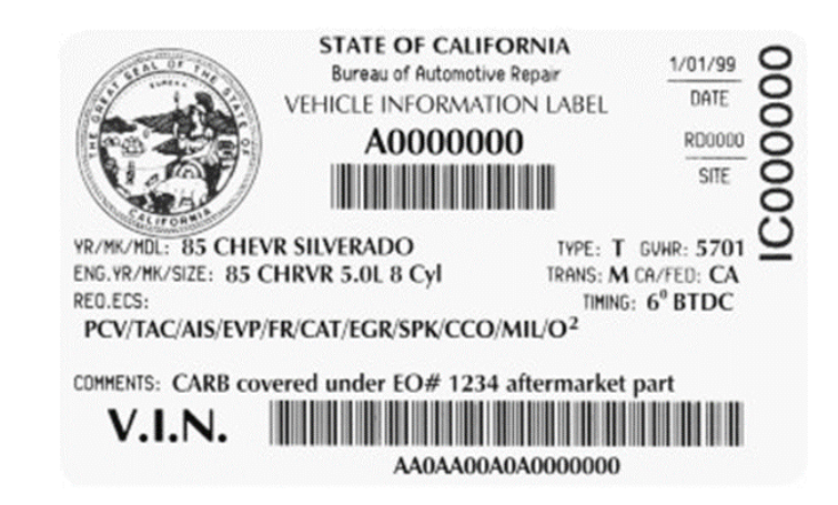
Figure 2: Example of Acceptable BAR Referee Label (all labels must include a serial number)

The BAR Referee Label serves as the emissions control "under-hood" label, providing emission control information for SPCNS, grey market vehicles, vehicles with engine changes, alternative fueled vehicles, and, as needed, other vehicles with unusual configurations. The Referee Label is typically, but not always, affixed to the left front door post. In some cases, the label may be located under the hood.