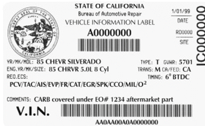
Figure 2: Example of Acceptable BAR Referee Label (all labels must include a serial number)

The BAR Referee Label serves as the emissions control “under-hood” label, providing emission control information for SPCNS, grey market vehicles, vehicles with engine changes, alternative fueled vehicles, and, as needed, other vehicles with unusual configurations. The Referee Label is typically, but not always, affixed to the left front door post. In some cases, the label may be located under the hood.