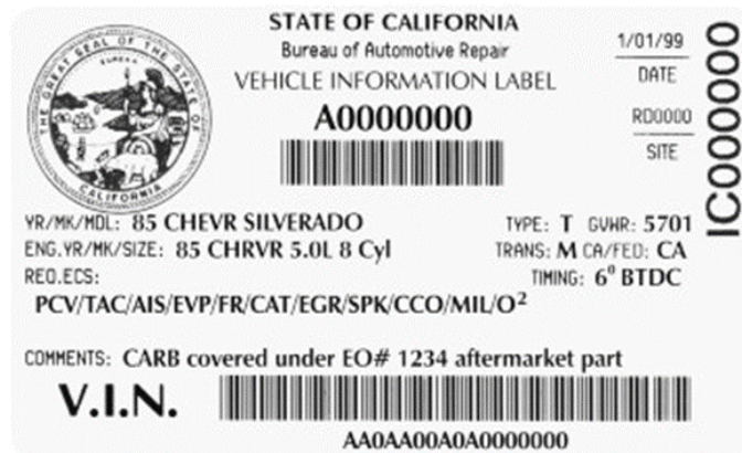
Figure 2: Example of Acceptable BAR Referee Label (all labels must include a serial number)

The BAR Referee Label serves as the emissions control “under-hood” label, providing emission control information for SPCNS, grey market vehicles, vehicles with engine changes, alternative fueled vehicles, and, as needed, other vehicles with unusual configurations. The Referee Label is typically, but not always, affixed to the left front door post. In some cases, the label may be located under the hood.